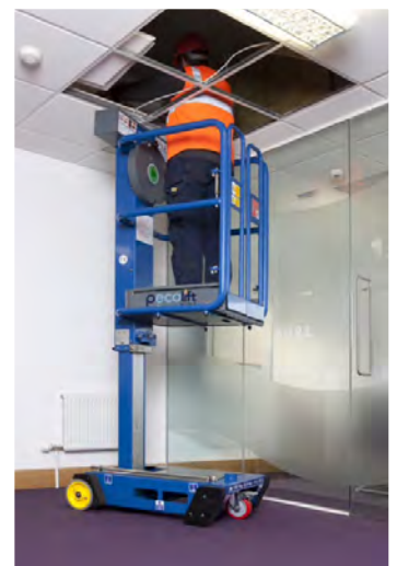
Smaller Pecolift shown in above images